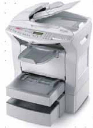
Shown with optional 2nd papertray

Print-copy-scan-fax 20 ppm print engine GDI printing 33k6 fax modem 19 cpm copy speed Colour scanning Document Management (paper port) 2xUSB (1 rear slave + 1 front host) ADF 50 sheets (DUPLEX!) 250 sheet paper tray Security - access codes